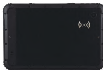
EM-T88 Rugged Tablet PC